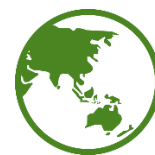
Existing Regional Network