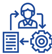
Existing Onboarding Process